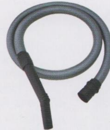
..... Hortum Flexi Hose