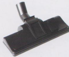
..... Süpürücü Gövde Nozzle